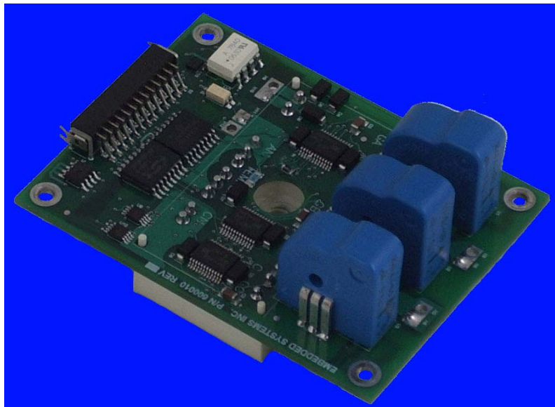
Figure 1 – Dragon Power Module